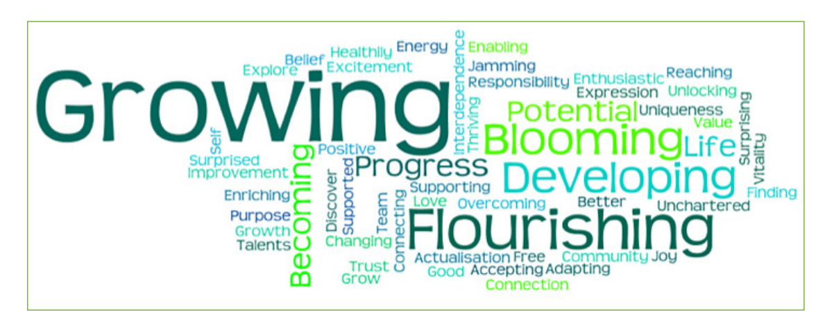
Figure 3: Word cloud created from the feedback at the TEDxQMU2015 event

We also commissioned a photography student, Sebastian, to make a visual display of flourishing, which our audience was able to view during breaks.