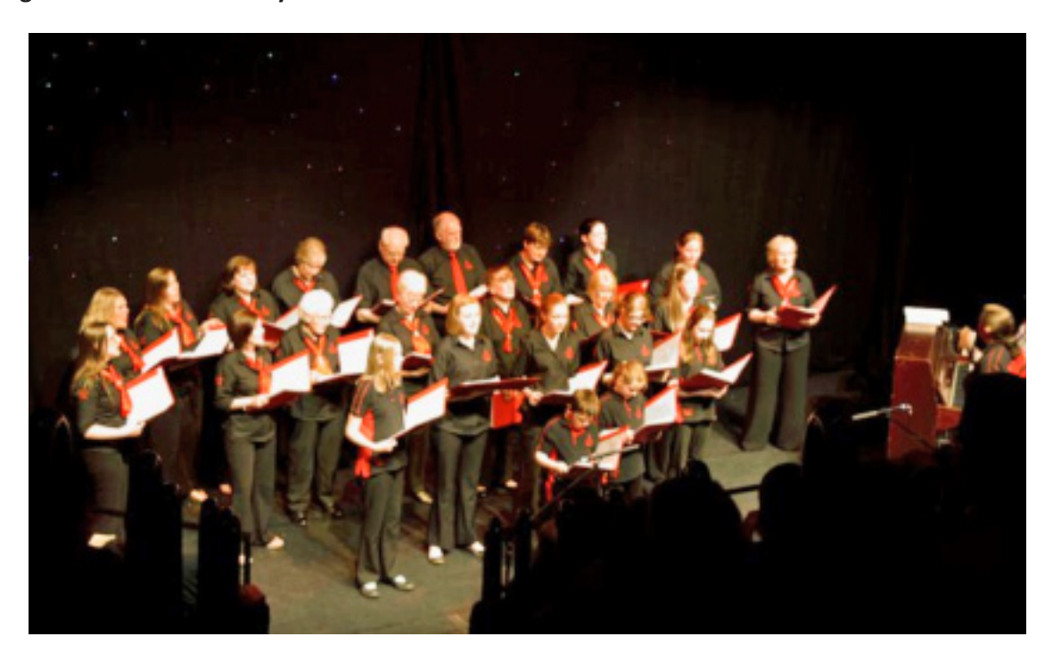
Figure 1: Clark Community Choir

Each speaker was introduced by a haiku – again, a refreshing and different approach (see Table 2).