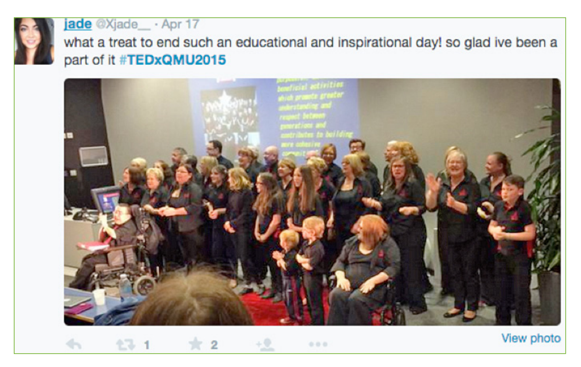
Figure 2: Informal feedback and evaluation on Twitter

People experienced different emotions throughout the day, from laughter to tears, standing ovations and spontaneous clapping mid-presentation... most people left feeling inspired, with a sense of happiness and wellbeing, and determined to flourish and empower others to flourish.